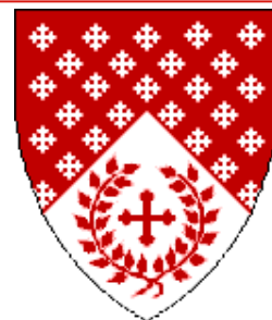
Dun Carraig's Arms

Deadline for Crown has passed. Camp Brown was lack on responding, so we were unable to put in a bid. Birthday will go on. The Financial committee voted