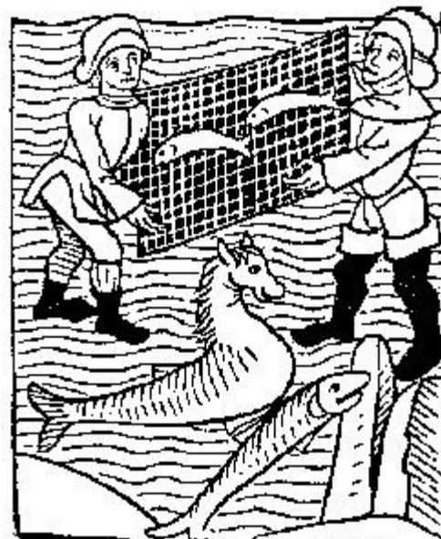
Fishermen and a seahorse; from Medieval Life Illustrations

Also, since there was no meeting in August because of Pennsic, the August and September issues are being combined.