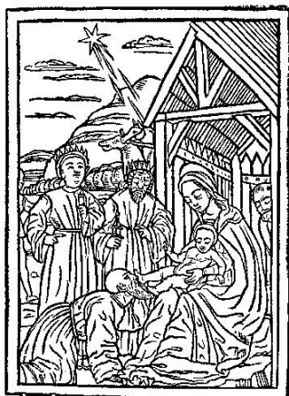
Adoration of the Magi; from Legenda Sanctorum Trium Regum , Modena 1490 Adoration of the Magi; from Legenda Sanctorum Trium Regum , Modena 1490