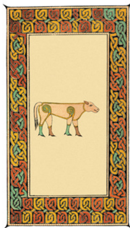
Symbol of St. Luke, from the Gospels of Durrow, 7th Century, Trinity College, Dublin. Design on cover page is from an ornamental page from the same book.

All pictures in this issue of Clyffe Notes are my own. All artwork is taken from Dover Publication books. Articles are courtesy of Stefan's Florilegium.