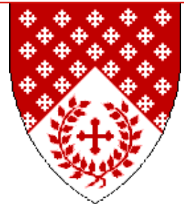
Dun Carraig's Arms