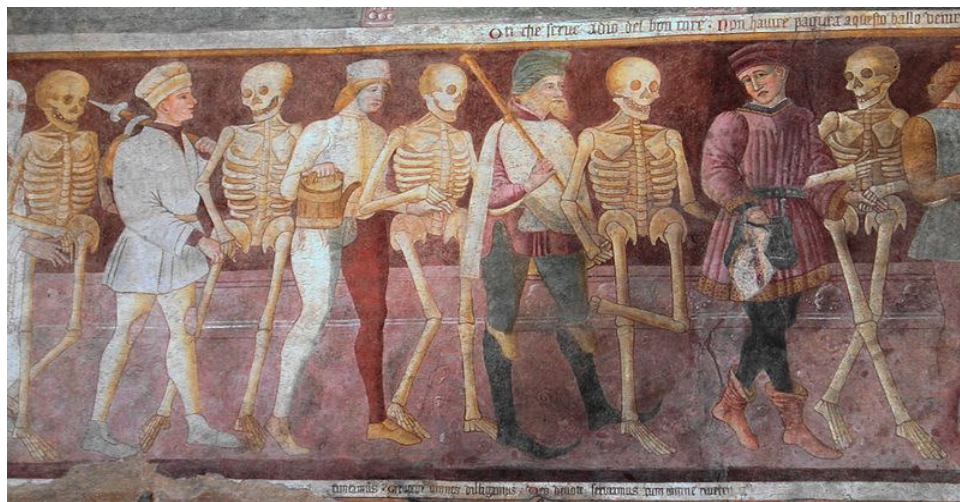
Detail from fresco "The Triumph of Death" in Clusone (Lombardy), Italy (1485)

https://commons.wikimedia.org/wiki/Category:Danse_Macabre