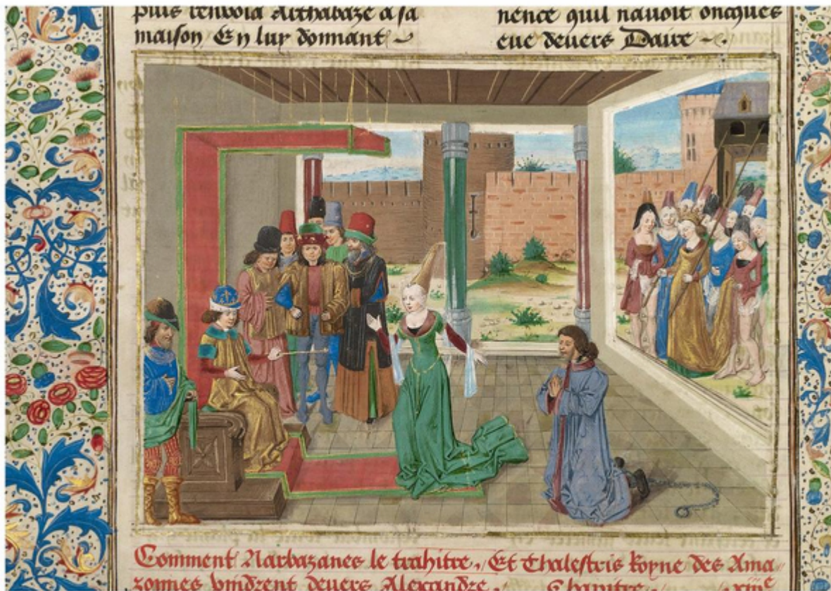
Bagoas/Bagoes Pleads on Behalf of Nabarzanes in The Book of the Deeds of Alexander the Great, about 1470–75, Master of the Jardin de vertueuse consolation and assistant, made in Lille and Bruges. The J. Paul Getty Museum, Ms. Ludwig XV 8 (83.MR.178), fol. 133v.

https://archive.org/details/betancourt_transgender_lives