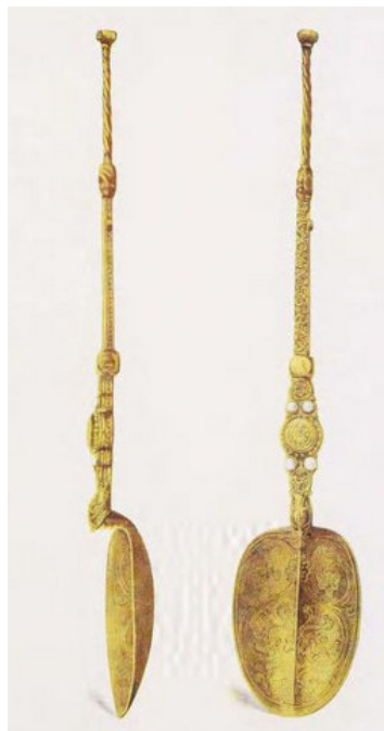
12th Century Anointing Spoon