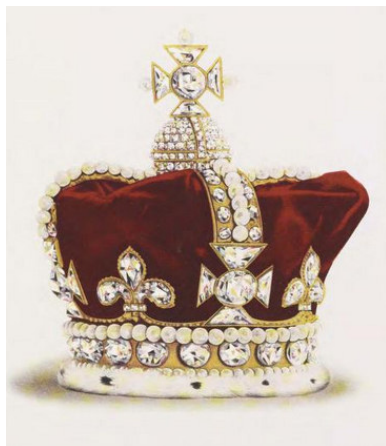
Queen Mary's Crown