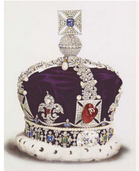
Imperial State Crown