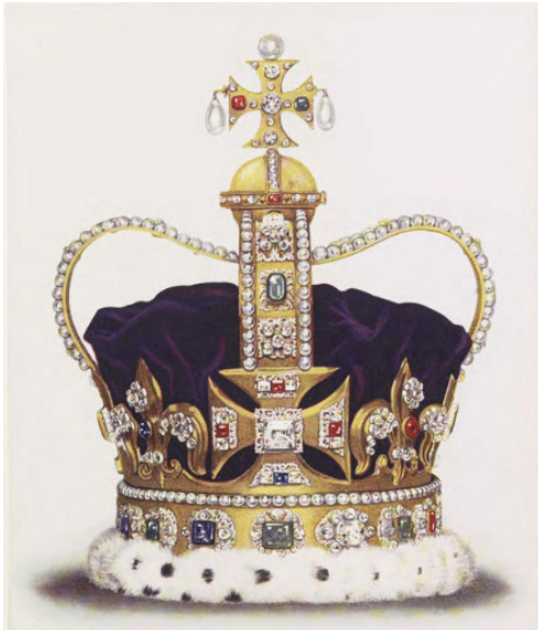
St. Edward's Crown