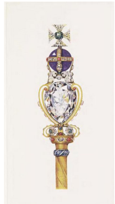
The King's Royal Sceptre