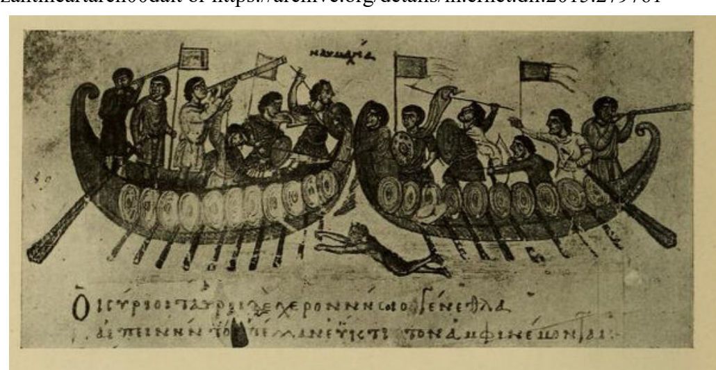
Fig. 288. A naval battle: miniature from the tenth-century MS, of the Cynegetica of Oppian in the Marciana, Venice. (Hautes Études : G. Millet.)